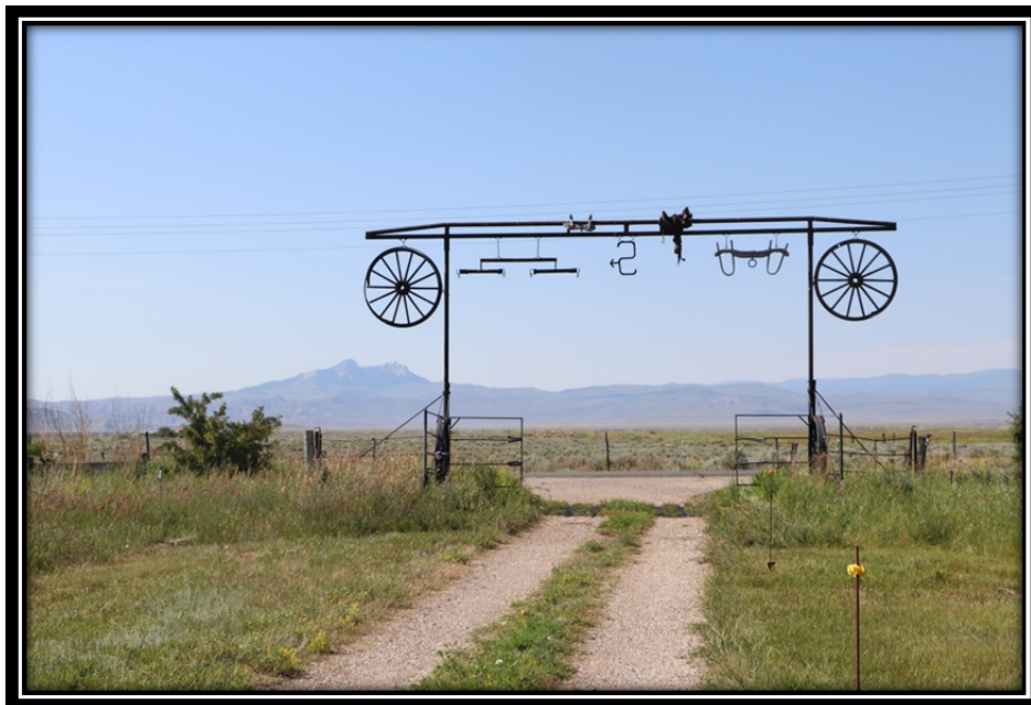
View of Heart Mountain