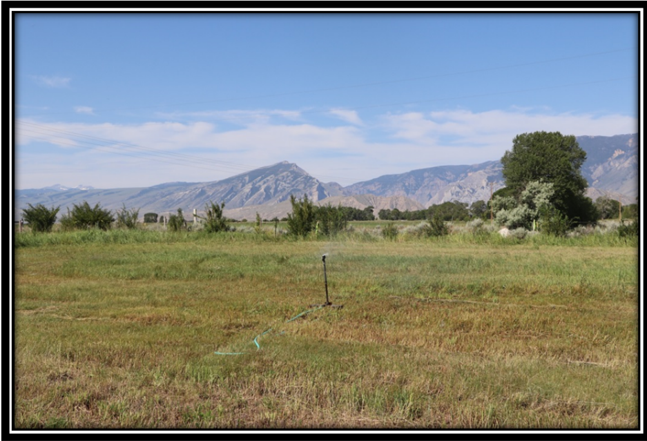
Pasture and Mountain Views