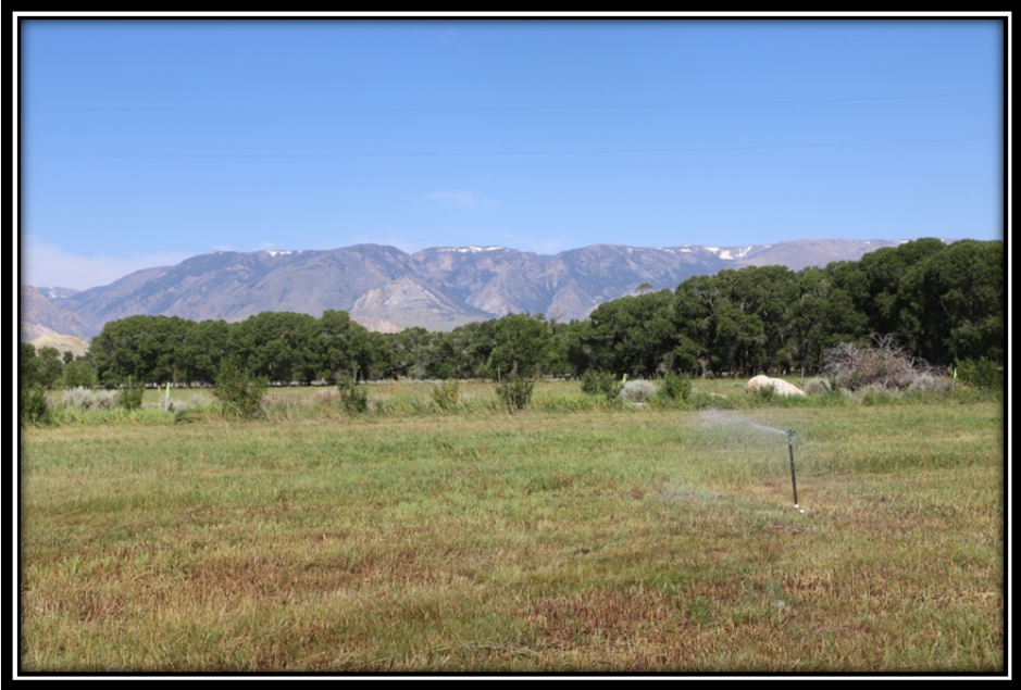
Pasture and Mountain Views