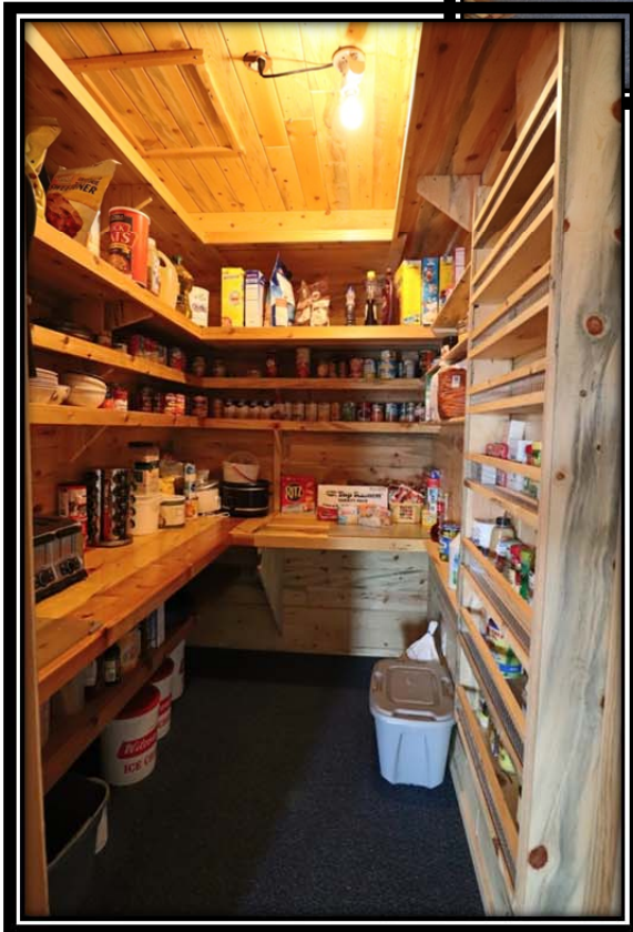
Large Walk-in Pantry